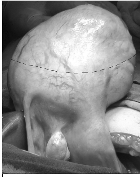
Fig 1: Myoma, in the base fallopian tube is seen, closure by is left ovary