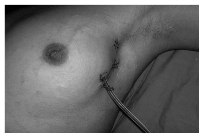
Figure 3. The axillary space after excision.

was entered for about 2- 3 cms. The trocar was removed and the sheath connected to the gas for insufflation and the 0 degree scope introduced. The space for access was then made by sweeping and darting movements of the telescope through the avascular loose areolar tissues like we do for a extraperitoneal space creation in a groin hernia repair. Once an adequate space was created two other 5 mm ports were made; two finger breadths above and below the 10 mm port. Subsequently, the dissection was done all around the lump with the use of a monopolar