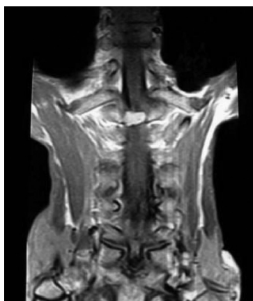
Figure 2. Contrast enhanced T1W1 coronal image of cervical spine showing Capillary haemangioma at C7 level.