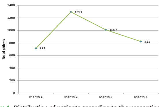
Figure 1. Distribution of patients according to the presenting month.