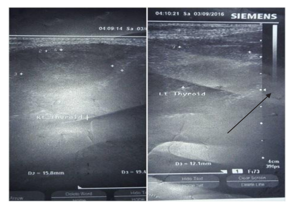
Figure 1. Showing right and left lobe of thyroid gland with absent isthmus.

about isthmus in ultrasonographic report. Fine-needle aspiration cytology was performed which was suggestive of Papillary carcinoma of right lobe of thyroid. Thyroid function test and other preoperative blood parameters were within normal limit. For the treatment, the patient underwent total thyroidectomy. During surgery, isthmus was absent, right and left lobes of thyroid gland were completely separated due to isthmus agenesis. (Fig. 2) Right lobe of thyroid measured 5x3x2 cm. External surface was brownish in colour with firm consistency. Left thyroid lobe measured 4.5x3x1.5 cm. External surface was smooth and brownish in colour. Histolopathological report of the specimen was consistent with well differentiated Papillary Carcinoma of right lobe of Thyroid gland and lymphocytic thyroiditis of left lobe of thyroid. His post-operative period was uneventful. Patient was discharged on seventh post operative day and he is under regular follow up.