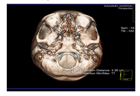
Figure 1. Antero-posterior length of the foramen magnum (APL)

Antero-posterior length of the foramen magnum (APL): This variable was considered as the distance between the basion and opisthion based on the description in the available literature (fig. 1).