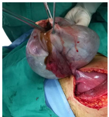
Figure 2. Right ovarian cyst after draining almost one liter of brown colored fluid content, twisted once in its pedicle

An exploratory laparotomy was performed at 18 weeks and two days. Under general anesthesia, a midline incision was made. There was a large multiloculate ovarian cyst twisted once in its pedicle seen from the right ovary with a normally appearing contralateral ovary (Fig. 2). There was no ascites; her omentum and upper abdomen looked grossly normal. Ovarian cystectomy with conservation and reconstruction of the right ovary was done. The size of the cyst after draining almost one liter of cystic fluid measured 22 X 16 cm (Fig. 3). The fluid content was brownish in color. The patient tolerated surgery well, and postoperative recovery was unremarkable. Fetal viability was documented. Prophylactic tocolytic was given. The patient was discharged home on the fourth postoperative day.