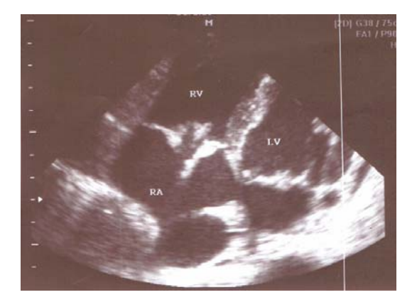
Fig. 1 Vegetation in Tricuspid Valve