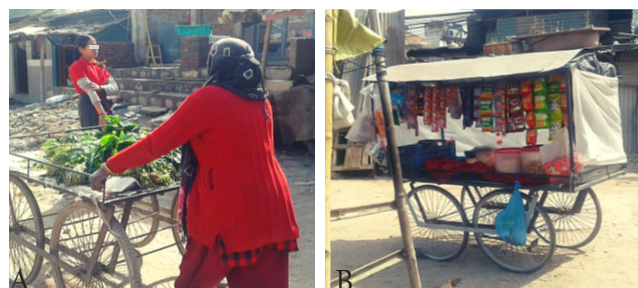
Figure 2. Mobile stalls with vegetables (A) and packaged junk food, (B) observed during transect walks in the Sinamangal-Minbhawan squatter area.

the morning and evening were selling seasonal fruits and vegetables (Fig. 2, A). Apple, orange, banana, papaya, and pomegranate were some of the varieties of fruits observed in the basket of fruit vendors. The vendors shared that people bought seasonal vegetables regularly, whereas fruits were only occasionally purchased.