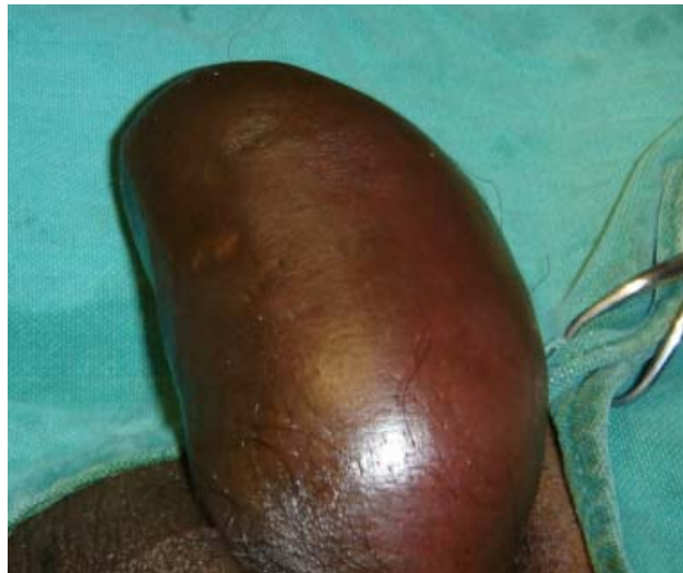
Fig 1: Eggplant deformity in fracture penis