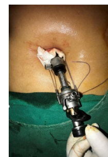
Figure 5. Insertion and fixation of Hassen cannula.