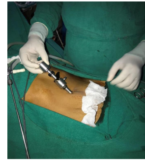
Figure 2. Direct trocar insertion technique

trocar/cannula as shown in figure 1 was held in the dominant (right) hand with the base of the trocar resting at the junction of the thenar and hypothenar eminence, and the index finger used as a guard against sudden and uncontrolled penetration into the peritoneal cavity. Then, with the dominant hand holding the trocar and aiming toward the side of elevation, twisting semicircular motion was continued till a "give"/ click sound of safety trocar was felt. At this time the trocar was withdrawn, and a cannula was further inserted by 2–4 cm depending upon the thickness of the abdominal wall. Then insufflation was started. A gradual increase in intraperitoneal pressure was noted. Entry into the peritoneum was confirmed by putting the scope into the cannula. The procedure is shown in figure 2. After the completion of the procedure, the ports were closed with the number 1 vicryl suture.