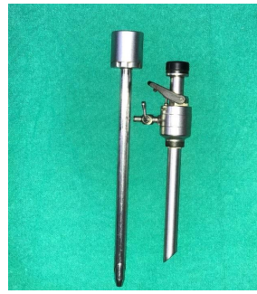
Figure 1. Safety trocar with

First, a supraumbilical skin incision was made. Blunt dissection was made through the subcutaneous layer up to the fascia. After the incision, the anterior abdominal wall was held by the nondominant (left) hand with a dry gauge piece and lifted up. A 10 mm sharp metal safety