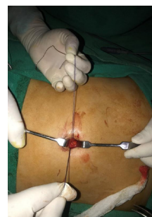
Figure 4. Stay sutures taken in rectus