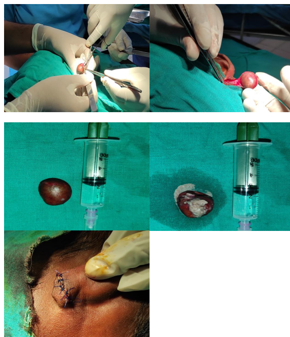
Figure 3. Intra operative photographs of the excision of the left pinna lobule cyst under local anesthesia.

The occurrence of an epidermoid cyst of the auricle is a rare entity. Only a few ear lobe epidermal cysts have been reported in the literature. Epidermoid cysts are also called epithelial dermal inclusion cysts, Infundibular cysts, keratin cysts. In 1859 Roser was the first who described epidermoid cyst. 10 In the head and neck region, the most common location is the lateral eyebrow. Out of all the dermoid cysts, which occur in the head and neck region, 11.5% are noted in the submental region. 11 There are two theories for epidermoid cyst formation: Firstly, during early intrauterine life the epidermoid cyst may occur when two epidermal surfaces fuse and an ectodermal implant is retained deep to the surface. Secondly, due to traumatic entrapment of surface epithelium in the connective tissue and further these cells may differentiate to form a cyst. 12 Epidermoid cyst in different locations causes