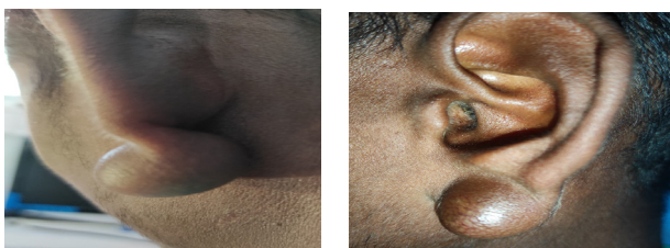
Figure 1. Clinical photograph showing the epidermoid cyst on the left pinna lobule.